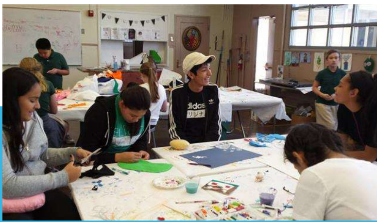
C) PASADENA EDUCATION NETWORK (PEN) WWW.PENFAMILIES.ORG - OCT. 2022